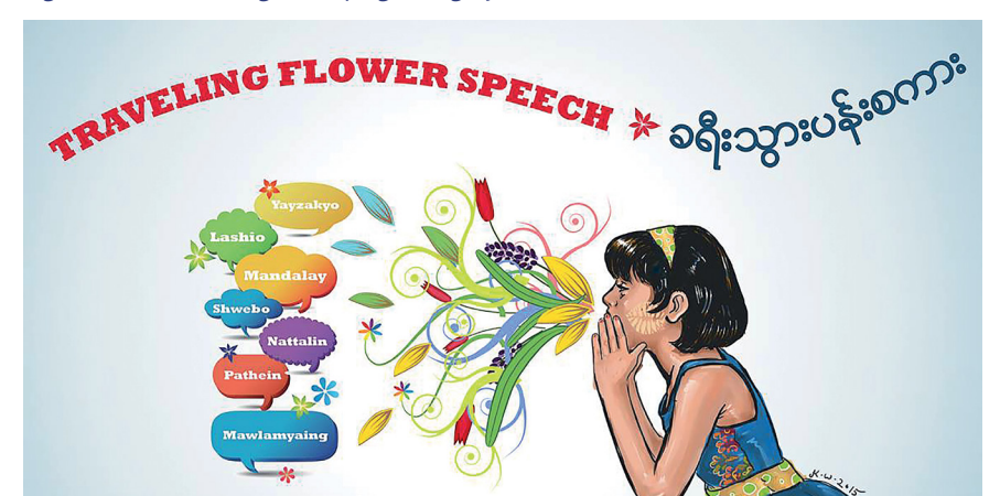
Figure 2: Initial Panzagar campaign imagery53

The Panzagar ("flower speech") Campaign<sup>51</sup>, launched in Myanmar in 2014 by Burmese youth leader Nay Phone Latt, was a response to escalating anti-Muslim violence. The campaign adopted the symbolic use of flowers, which represent peace in Myanmar. Civil society reports highlighted that online hate speech in the country was primarily directed toward Muslims. The campaign's core strategy involved collaborating with young local graphic designers to create anime-inspired visuals featuring characters with flowers emerging from their mouths, which were widely circulated on social media.<sup>52</sup>